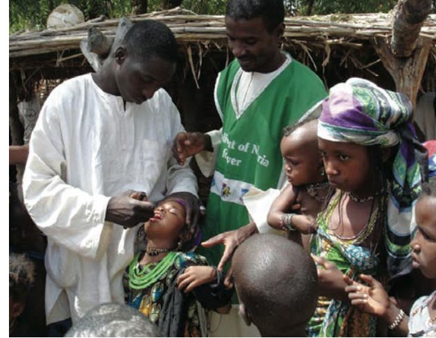
Families in a non-compliant Fulani settlement accepted polio vaccine after their leaders were convinced of its safety and importance.

Jigawa State supports a large population of Fulani herdsmen and traders, whose nomadic lifestyle means their children often miss out on immunizations. Before the March 2007 IPDs (i.e., mothers who have refused to allow their children to be vaccinated), COMPASS invited 15 Fulani Ardos (leaders) in the Gwaram Local Government Area (LGA) to a discussion, where they voiced their fears and assumptions about polio immunization and learned from trusted leaders about the realities. They became convinced of the importance of the campaign and, following their lead, 7,022 Fulani children were immunized, 261 of them were zero-dose. Similar efforts in 11 neighboring LGAs reached 29,627 children (1,049 of whom were zero-dose). In that Gwaram campaign alone, zero-dose cases dropped by 31.8 percent and immunization increased by 2.4 percent. Some members of the Fulani community have been trained as vaccinators and recorders, ensuring their continued commitment to the program. COMPASS continues now to apply this approach in other states.