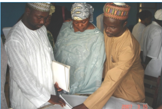
Participants from Bauchi cross-checking routine immunization register in Gudi health facility in Akwanga Local Government, Nasarawa state