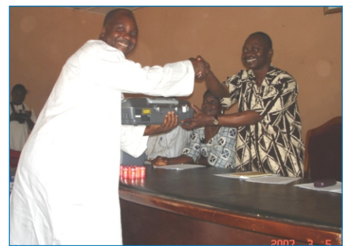
Delighted head teacher receiving a CD player during the event in Nasarawa

Thirty primary schools in Karu, Nasarawa State were proud recipients of 90 CD players and pre-recorded primary 3-6 Interactive Radio Instruction (IRI) programs in an event held on November 5, 2007. The presentation of the CD players was in response to a prevailing radio signal problem which prevented teachers and pupils in the area from participating in and benefiting from the IRI program.