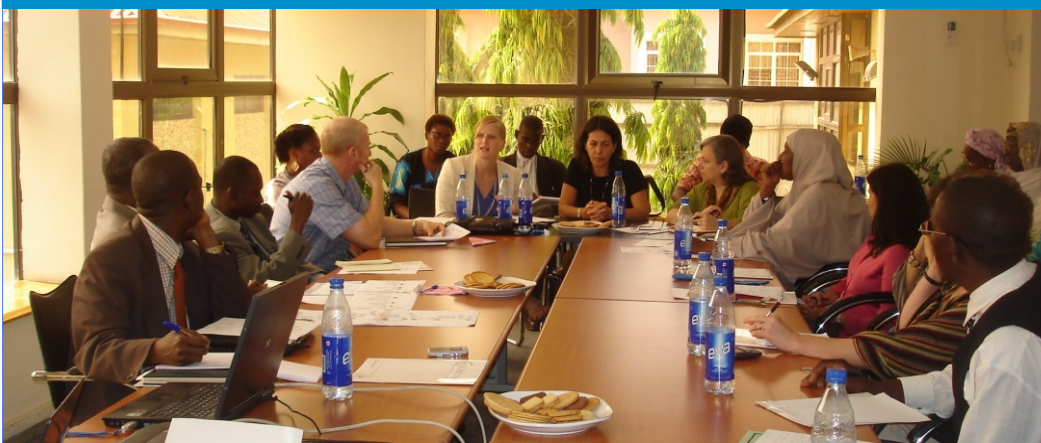
Crosssection of participants at the partners meeting in Abuja

On November 15 th and 16 th , the third annual international partners meeting was held in the Abuja Central Office with representatives from each of the nine COMPASS partner organizations. The meeting objectives were to share project achievements and challenges, review and strengthen COMPASS partnership and maximize collaboration for increased results in Year 4.