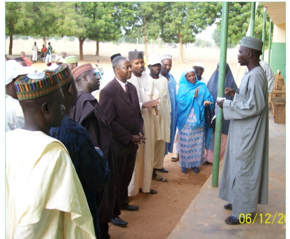
COMPASS Chief of Party, COMPASS Kano state program staff and Community Coalition members listen with rapt attention to achievements in education outcomes highlighted by the headteacher in Zakirai Yamma quality school in Kano state